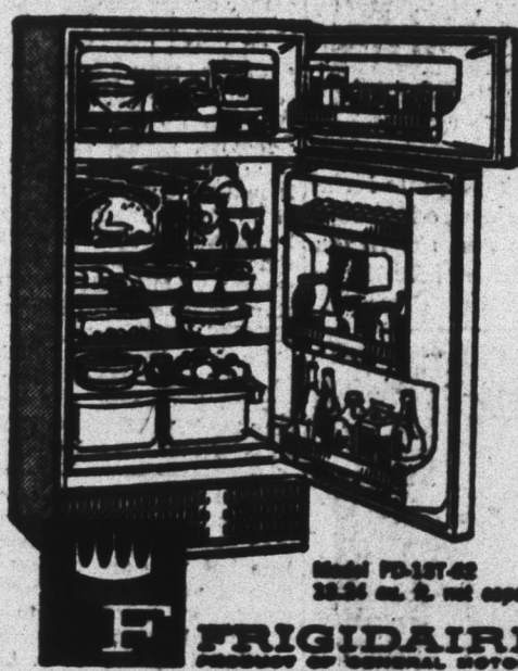
Model FD-127-02 26.56 cu. ft. net capacity FRIGIDAIRE PRODUCT OF GENERAL MOTORS

It's a nationwide event and we're out to sell more Frigidaire Appliances than any other dealer our size. You'll see how when you see our bargain prices! Hurry! Don't miss out!