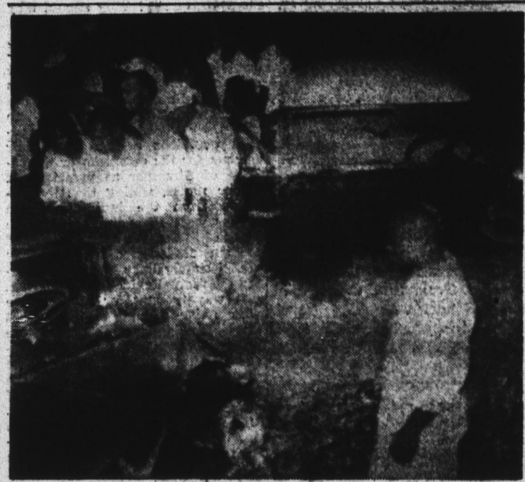
FIVE INJURED — Five persons were injured in the smash-up Monday night as an automobile going east on Cabarrus St. was hit by an auto going north on East St. Persons were treated at Rex and Wake Hospitals. All are in fair to good conditions.