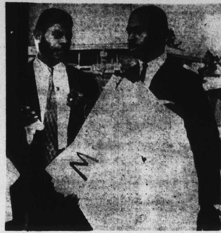
are shown above as they ended their "Silent Protest" last Sunday. ple who had attempted to be served in the restaurant. This demon- en's Voters Council, and the local chapters of The National As- Highway patrol, and members of the Wake County Sheriff's de-