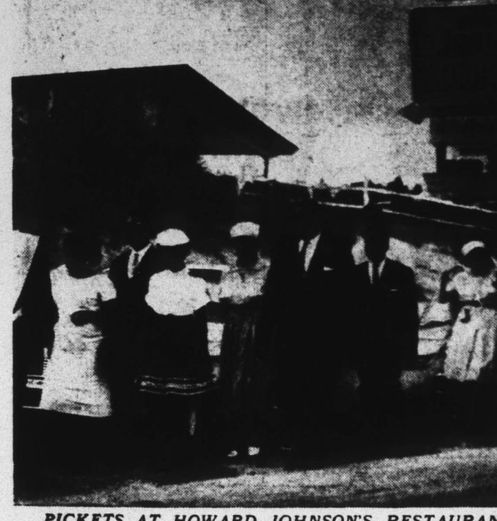
About 60 cars joined in the motorcade originating at the First stration broke all records for orderly yet forceful expressions of sociation for the Advancement of Colored People and The Con-Baptist Church, carrying approximately 300 leading citizens who discontent with "Jim Crowism" in Raleigh, and was sponsored gress of Racial Equality. Traffic was kept moving during the