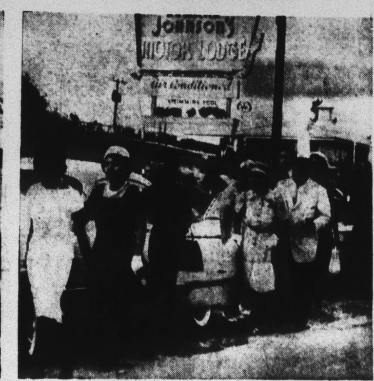
PICKETS AT HOWARD JOHNSON'S RESTAURANT were protesting the arrest the previous week of three young peo- jointly by The Raleigh Wom- demonstration by members of the Wake County North Carolina