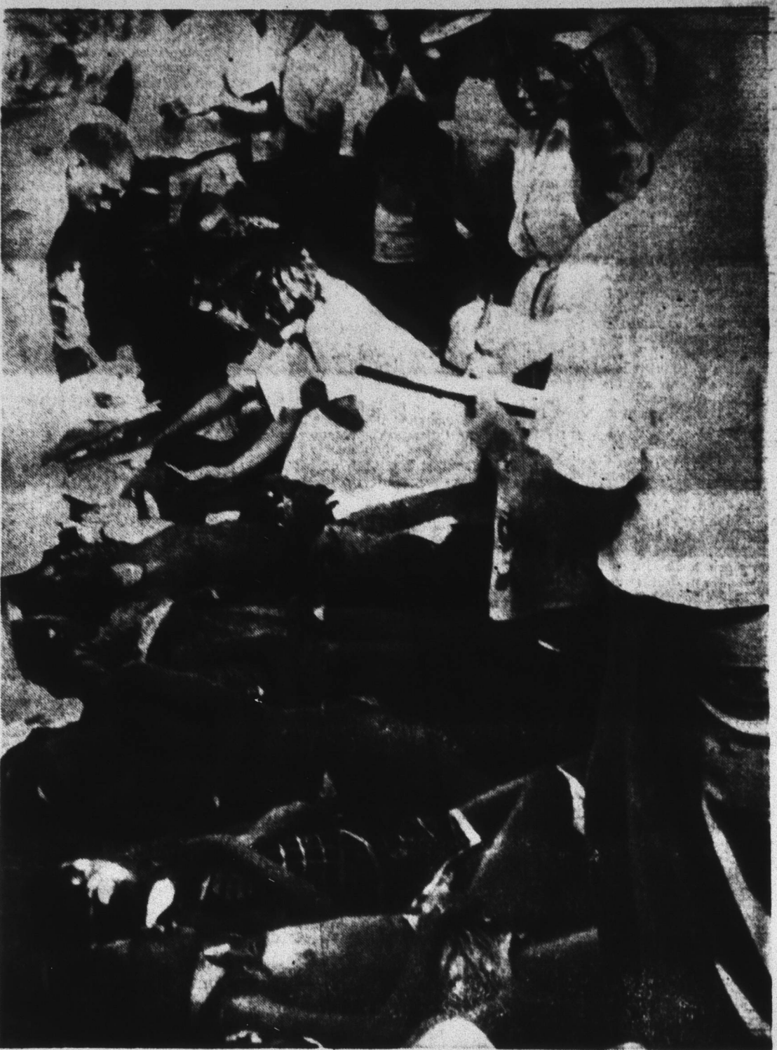
IDENTIFY VICTIMS — Members of a rescue team at Lake Talquin near Quincy, Fla., begin the grim task of identifying 17 children and one adult who died here when their overloaded fishing boat capsized in 8 to 10 feet of water.