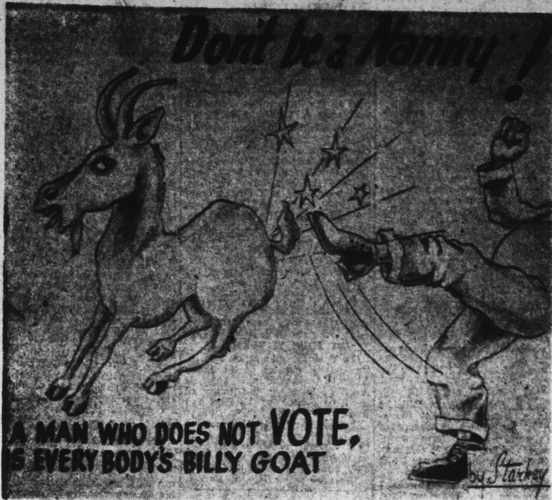
A MAN WHO DOES NOT VOTE, IS EVERYBODY'S BILLY GOAT