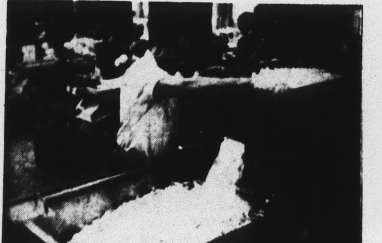
NEW SUPPLY OF COINS — Newly minted quarters pour into a hopper as the U. S. Mint in Philadelphia rolls into an overtime schedule to help fill the demands resulting from a shortage of the coins November 20th. Mints in Philadelphia and Denver, Colorado produce the nation's supply of coins.