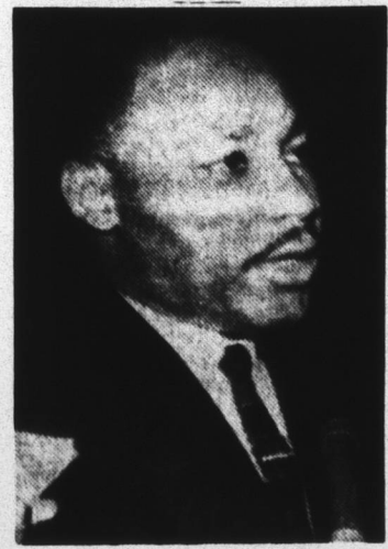
DEANS IN ROCKY MT. — Dr. Martin Luther King spoke to the Rocky Mount Voters League Tuesday night, at the Washington High School. More than 1500 people attended. The militant leader is being sought by the leaders of the Edenton protest movement to appear there in December. He is president of the Southern Christian Leadership Council, with offices in Atlanta.

Some 90 Negroes and four whites face trial in Municipal Court, Dec. 7 as the result of demonstrations at the S&W and Mayfair cafeterias