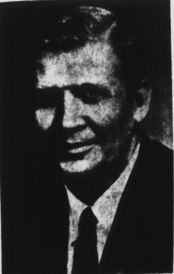
SHAW TO HEAR GOVERNOR — Terry Sanford, Governor of North Carolina, will speak at Shaw University on Monday, December 3, at 12:00 noon in Greenleaf Auditorium. The public is invited.