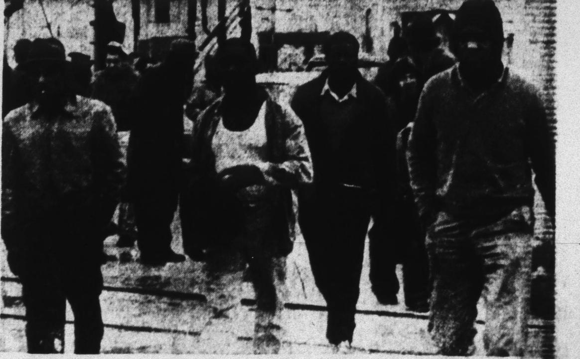
PICKETS CURSE DOCK WORKERS — Galveston, Texas: The members of an independent union who off-loaded 50,000 boxes of bananas from the Swedish freighter "Brita Thord" cross ILA longshoremen picket line at Galveston docks December 27th, amid jeers and curses. Law officers stood by as the independents worked for the second day unloading the vessel. Some leaders of the independent union have reportedly received threats of bodily harm from some persons.