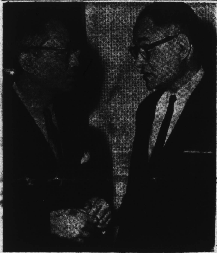
U THANT AND RALPH BUNCHE — United Nations Secretary General U Thant (left) and U. S. Mission Undersecretary Ralph Bunche chat during reception at the Delegates' Dining Room at UN headquarters recently. Thant received earlier in the day General Assembly endorsement on his Congo policy, as the Assembly voted to continue his Congo program for at least another six months. Bunche is the Congo expert for the U. S. in the UN.