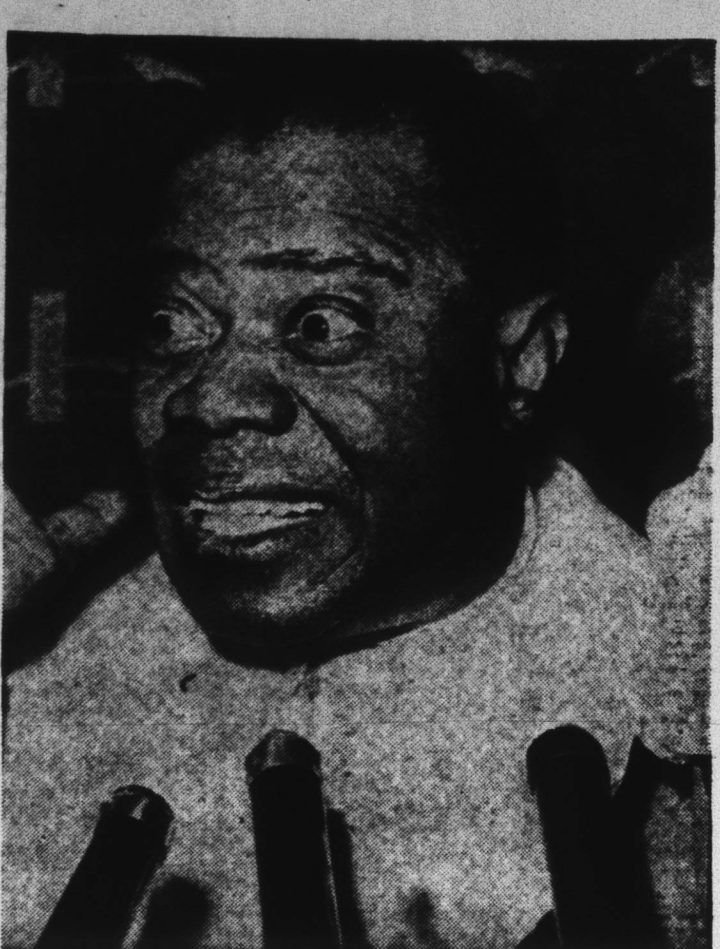
FIFTY YEARS OF BLOWING — Louis (Satchmo) Armstrong announced from Hollywood, Calif., that New Year's Day marked 50 years of trumpet playing for him. He said that it had been a pleasure to have blown that long and that he was ready to start on his next 50 years. His blowing came as a strange quirk in his life. It was on a New Year's Day, in New Orleans, that he was picked up for shooting a gun. He was sent to a school of correction and began playing with the school band. Once out, he continued and today is considered the "King of the Trumpet."