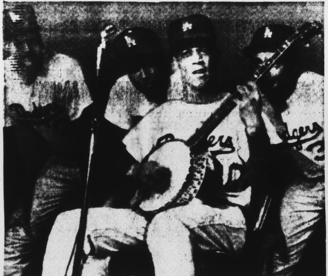
FINGERS FAST TOO — Maury Wills' flying finger match his flying feet as the Los Angeles Dodgers' baseball star amuses audiences at the Desert Inn in Las Vegas with his banjo playing and his showmanship. Coaching from behind are (left to right) Frank Howard, Duke Snider, and Sandy Koufax. These Dodger stars, plus Willie Davis and Don Drysdale (not shown), are making their professional debut with comedian Milton Berle in the Desert Inn floor show.