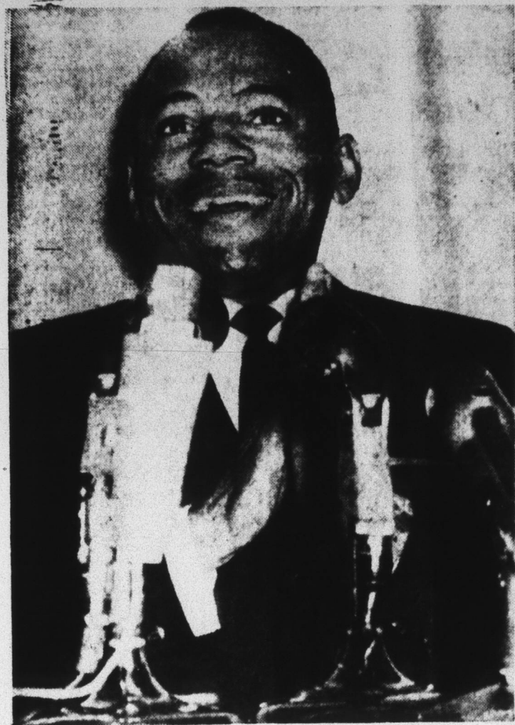
SHOOTINGS FORCE MEREDITH HOME —James Meredith, first Negro to enter the University of Mississippi, told newsmen in Chicago he is determined to remain at the University despite the shooting of his parents' home at Kosciusko, Miss. Meredith had planned to spend the Christmas holidays in Chicago, but the shooting incident forced him to return to his home in Mississippi.