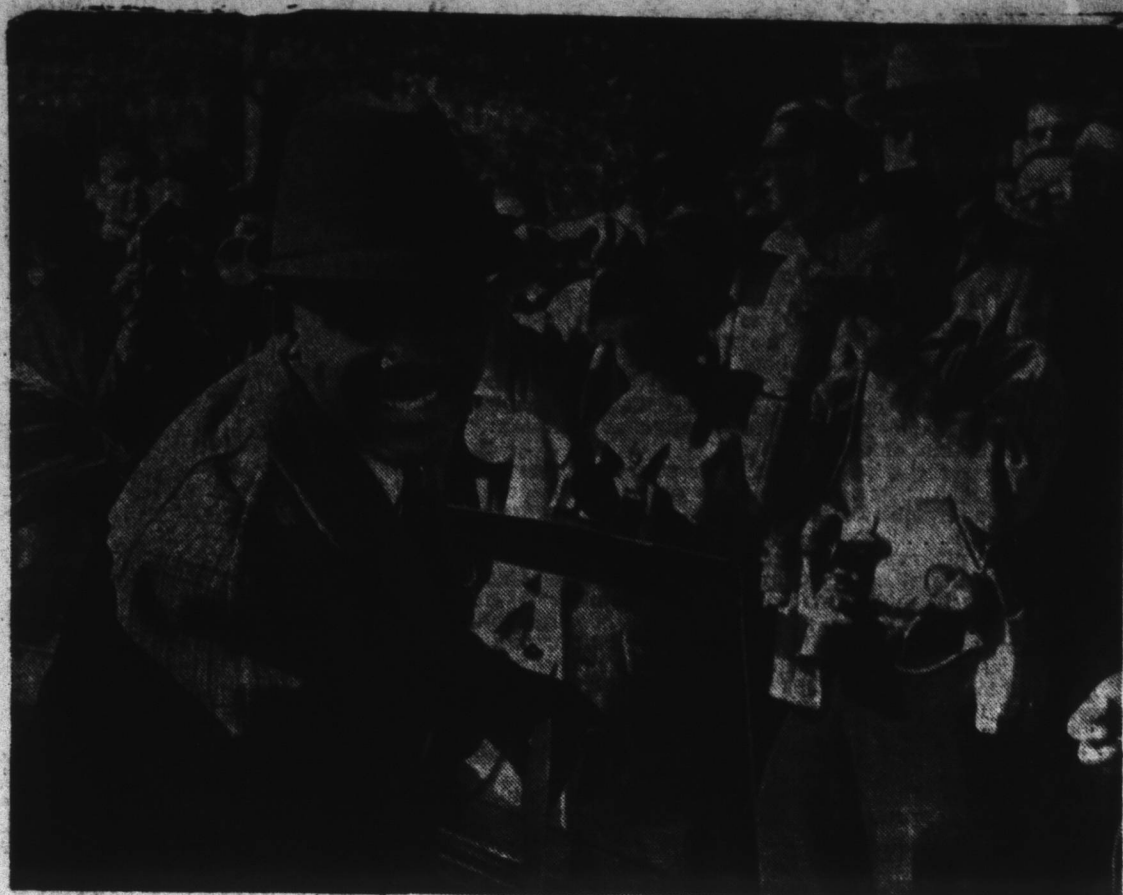
GETTING ACQUAINTED — Harvey Gantt, facing a battery of photographers, TV and newsmen, on his arrival on the campus of Clemson. Gantt enrolled without incident. Most of the students on campus greeted him courteously. Several professors shook hands with him, but none of the students.