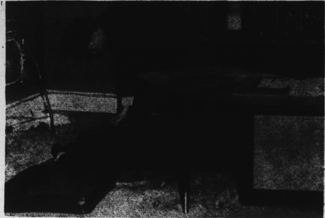
SLAIN COUNCILMAN — This is the scene in the office of Benjamin (Duke) Lewis, Chicago alderman, as officers examine the office and the body for clues. He, still handcuffed, is lying in a pool of blood. (UPI PHOTO).