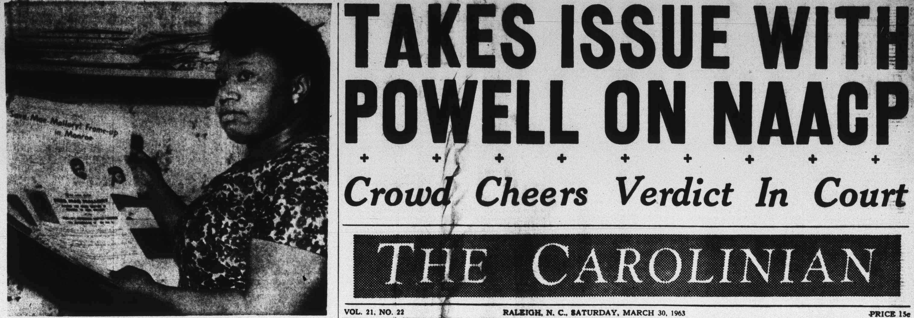
FIGHTING EXTRADITION TO N. C. - After serving more than a year in jail Mae Mal-HollySprings Man Held very was freed on $15,000 bond although she is still fighting extradition to North Caorlina where she is wanted for trial on a kidnapping charge. The 35-year-old woman's kidnapping charge grew out of a racial disturbance in Monroe.