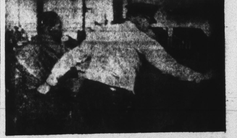
GRABBED BY SEAT OF PANTS — A police officer grabs Rev. Martin Luther King, southern integration leader, by the seat of his trousers in jailing him for leading an anti-segregation march in Birmingham.