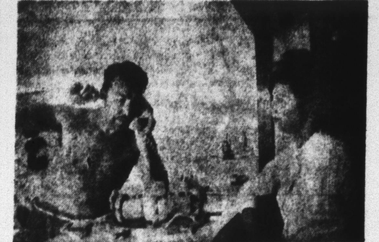
HEARING THINGS — Rep. Adam Clayton Powell, taking a call from Secretary of Labor, W. Willard Wirtz, looking like the picture of informality in Beach-Front home in Puerto Rico. In this photo from the current issue of LOOK MAGAZINE, Powell inserts a finger in his ear to reduce the noise of the pounding of the surf outside his door.