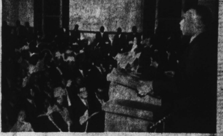
Dr. Martin Luther King is shown as he addressed a mass meeting in Memphis, Tenn., where he is said to have said that the South will soon be represented by Negroes in the U. S. Congress. 2,000 persons are said to have attended the meeting.