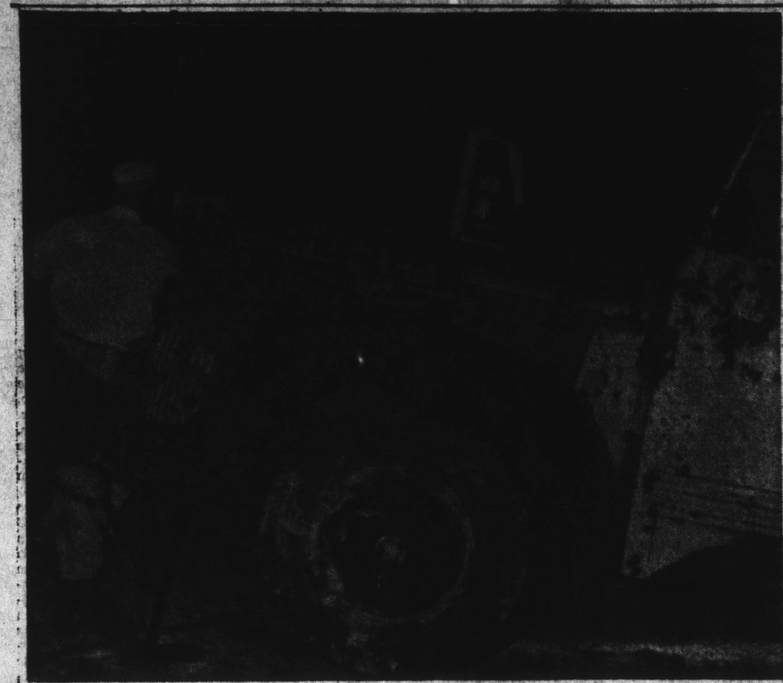
DOOMED BUS: Pahokee, Fla. — A wrecker tows out a bus in which 27 Negro farm workers drowned late one afternoon when it plunged into deep canal. The workers were returning from the fields. (UPI PHOTO).