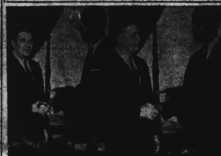
GOV. STAYS TO PRODUCE — Governor James B. Hunt, left, and Mrs. Sanford, right, are seen in a photo as they stand with the West Charlotte Senior High School band and the subject, "Music, Friend or Foe?" Sunday here, right, received the Governor's felicitations for having won top honors in the North Carolina Academic Contest. His subject was in the field of music. He is also a senior of West Charlotte Senior High School. Both students were honored at a dinner given at the Executive Mansion with Governor and Mrs. Sanford as hosts.