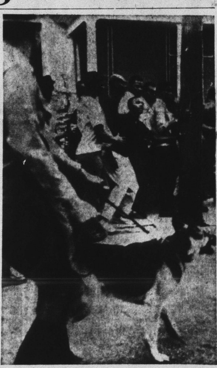
RACIAL DISORDER REACHES NEW PEAK —Rising Negroes above ignored the mobilization of the National Guard unit and demonstrated for the fourth straight night as racial disorder reached a new peak in the Eastern Shore community of Cambridge. The above demonstrators march from their section of the city to the courthouse square, escorted by helmeted police with dogs. Two white men were shot in the neighborhood of the courthouse as they stepped out of their houses. No arrests had been made in the shootings at press time.