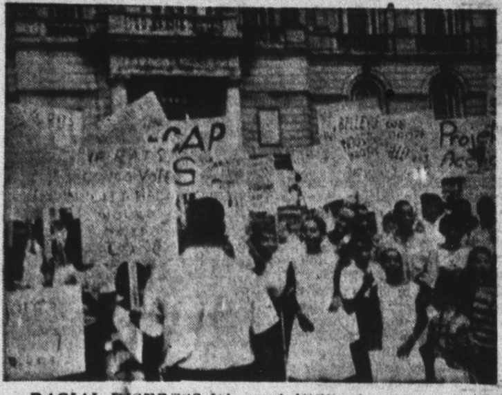
RACIAL DISTRESS IN NEW JERSEY — White hooded pickets hold him back, and angry picket yells at Negro policeman on duty Aug. 5 at the construction site of the Union County Courthouse Annex. The demonstrator hollered to the officer that he, too, should be on the picket line. Some 200 demonstrators were marching in protest over alleged employment discrimination, in Elizabeth, N. J. (UPI PHOTO).