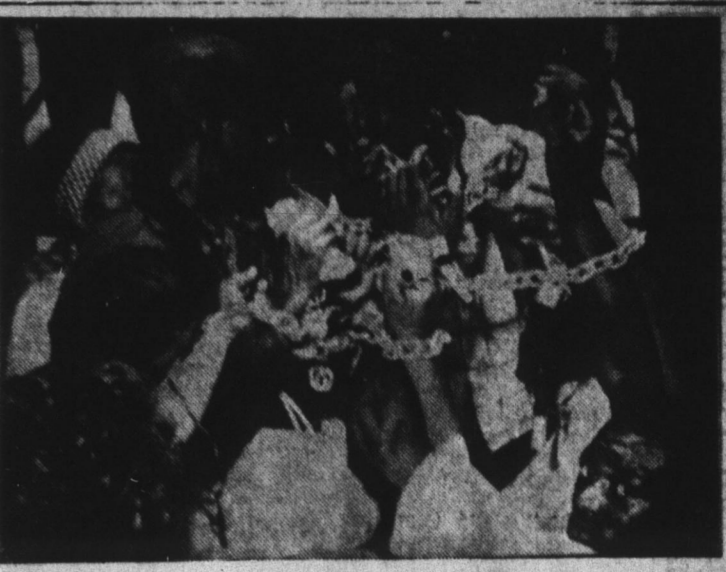
CHAINED — Chained anti-discrimination pickets raise arms skyward as they try to block entrance to construction site of Downstate Medical Center August 5th. Pickets who chained themselves to protest alleged anti-Negro bias in building trade unions, succeeded in blocking off the main entrance to the site for an hour, in Brooklyn, N. Y. (UPI PHOTO).