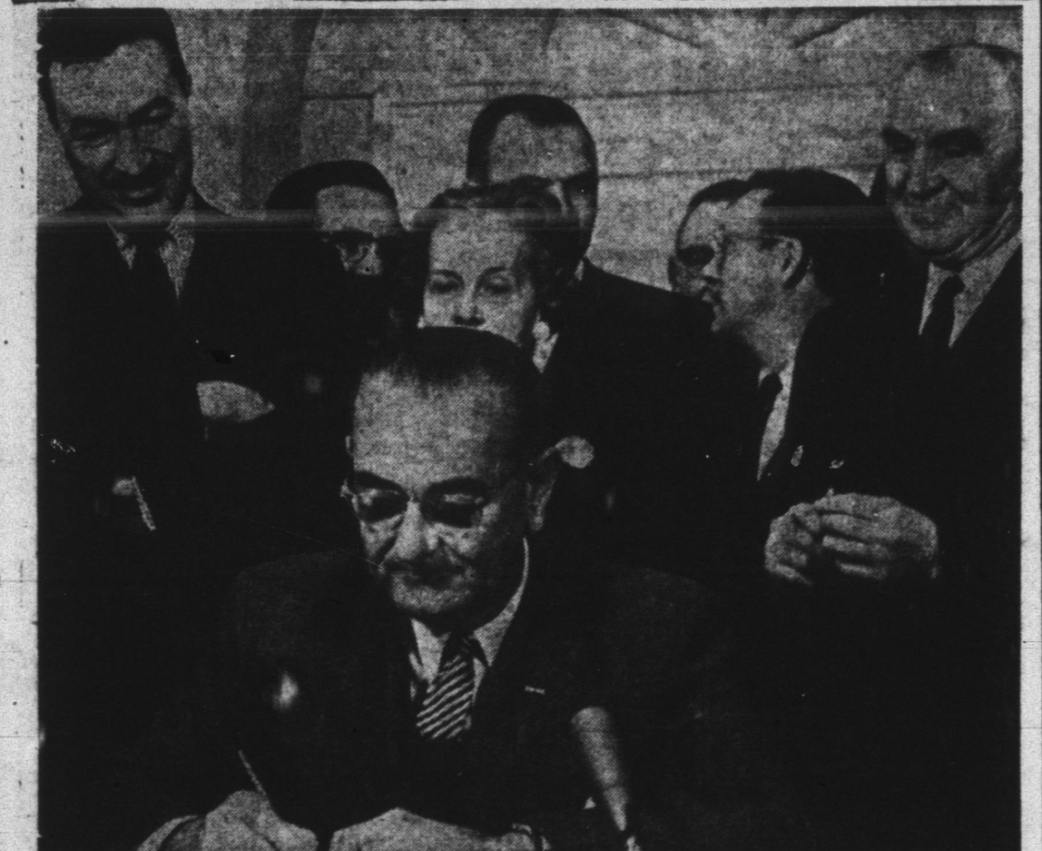
JOHNSON SIGNS EDUCATION BILL — In a ceremony at the White House last week, President Lyndon Johnson signs legislation setting up a $1.2 billion grant and loan program to help colleges build classrooms, laboratories and libraries. Watching are, left to right: Rep. Adam Clayton Powell, D-N.Y.; Sen. Winston L. Prouty, R-Vt.; Rep. Edith Green, D-Ore.; Rep. Albert H. Quie, R-Minn. (behind Rep. Green); Rep. Robert P. Griffin, R-Mich.; and Sen. Wayne Morse, D-Ore.