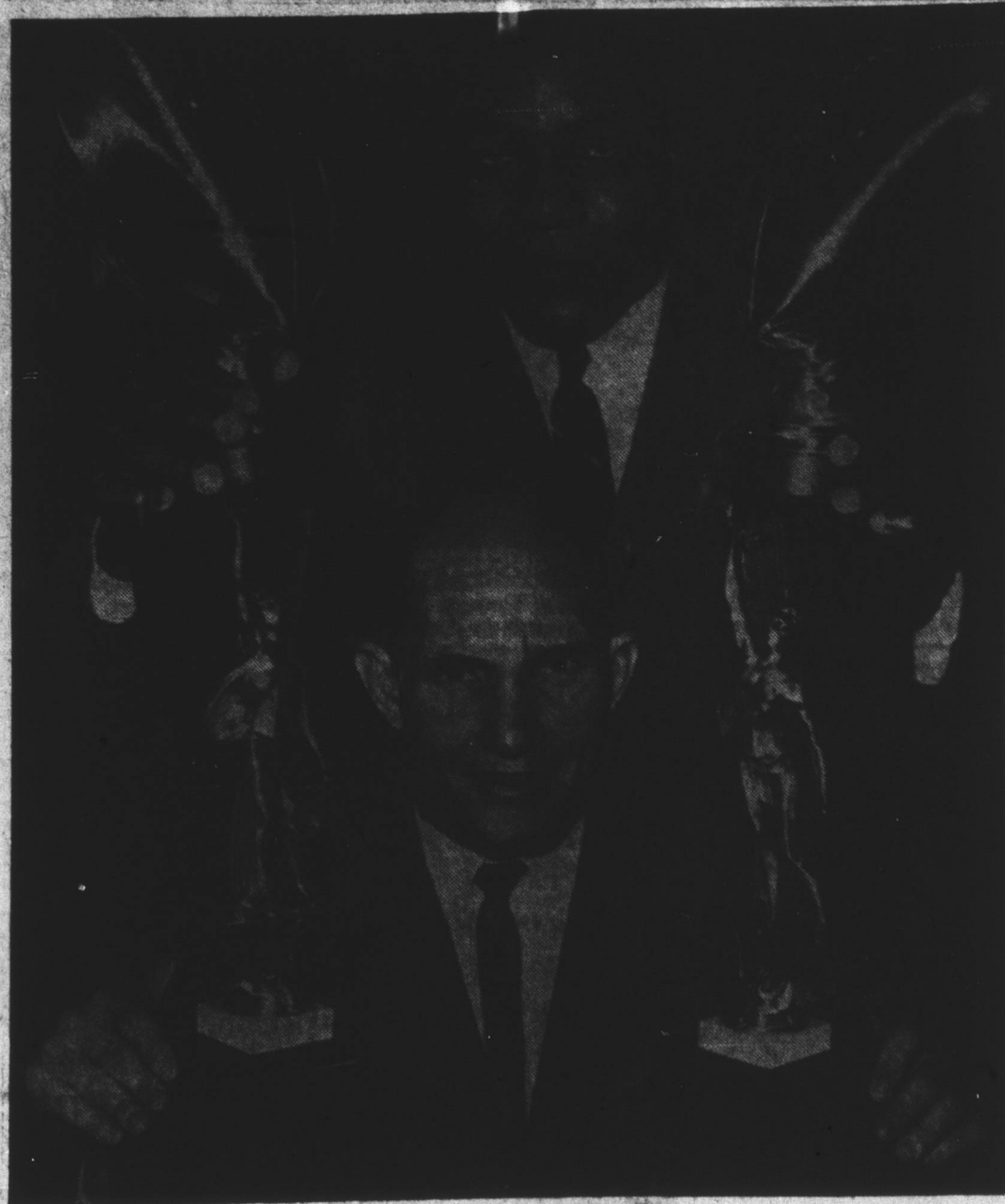
TWO AT THE TOP—Cleveland Browns' Jimmy Brown (Top) and New York Giants' Y. A. Tittle are named by their Newspaper Enterprise Association (NEA), "Jim Thorpe" Memorial Awards have been presented since 1955 to the top professional football player of the year. Tittle and Brown are the first double winners.