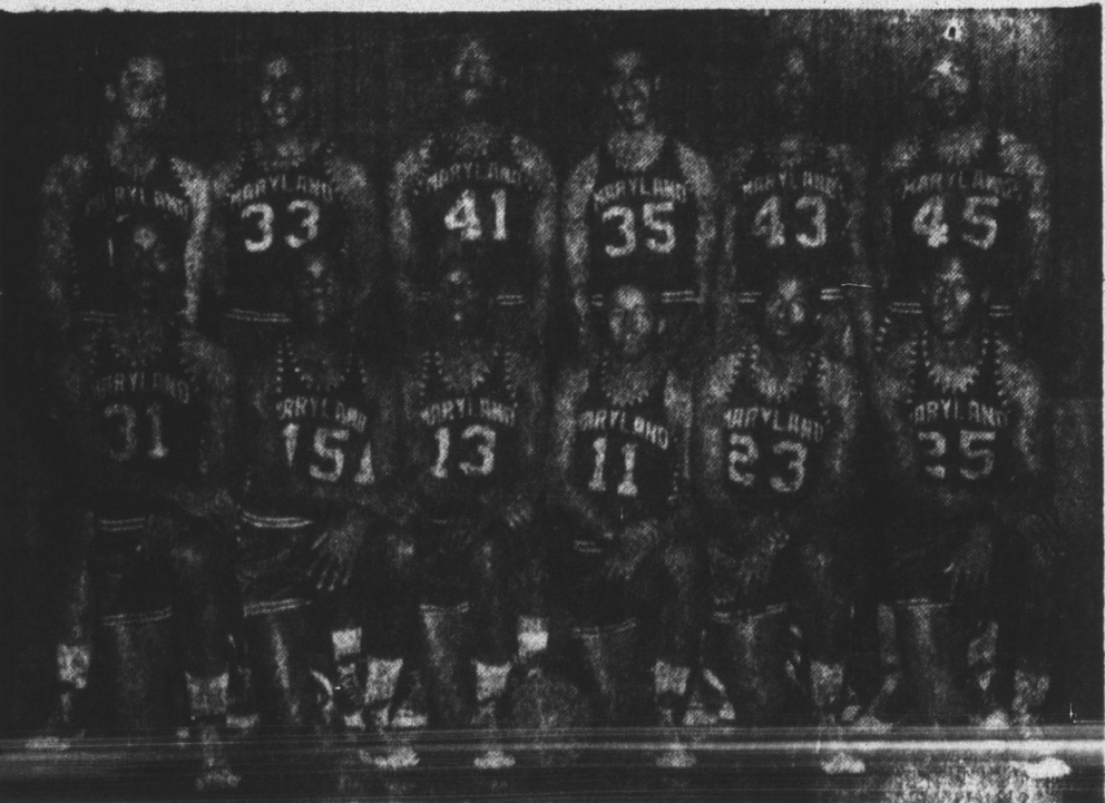
MARYLAND STATE COLLEGE