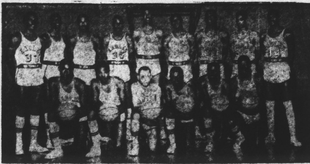
NORTH CAROLINA COLLEGE