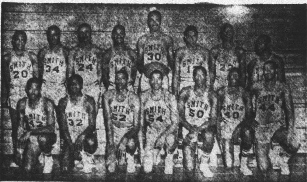
JOHNSON C. SMITH UNIVERSITY