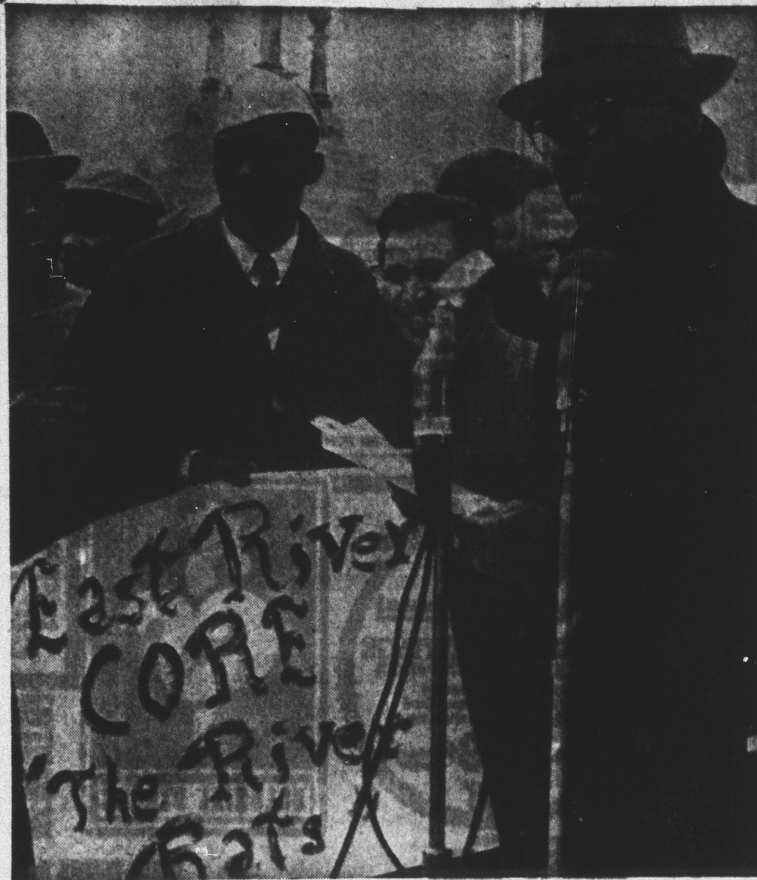
STATE CAPITOL DEMONSTRATION - Negro labor leader A. Philip Randolph (R) addresses crowd of 3,000 demonstrators that converged on Albany, N. Y., March 10 seeking civil rights and social reforms. Randolph told the demonstrators, "We had a useful but disappointing—but not discouraging—conference with Governor Rockefeller." The demonstrators, mostly from New York City, suffered from a cold, snowy and slushy blow by the weather.

Senter-Sanders Tractor Corporation March 7, 14, 21, 28, 1964.