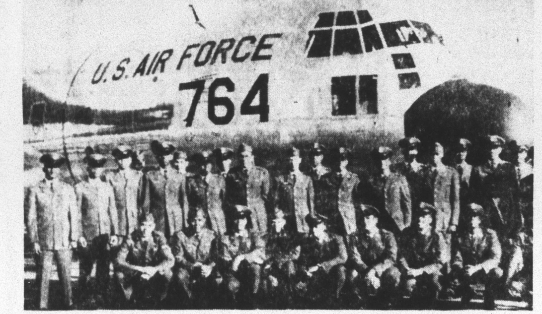
ON COAST-TO-COAST FLIGHT — These cadets, in the Air Force ROTC Detachment at A&T College, last week flew to Edwards Air Force Base and Los Angeles, both in California, on a motivation flight and enrichment tour as guests of the U. S. Air Force. In the background is the giant C-130E Transport plane in which the cadets took the four-day coast-to-coast jaunt.