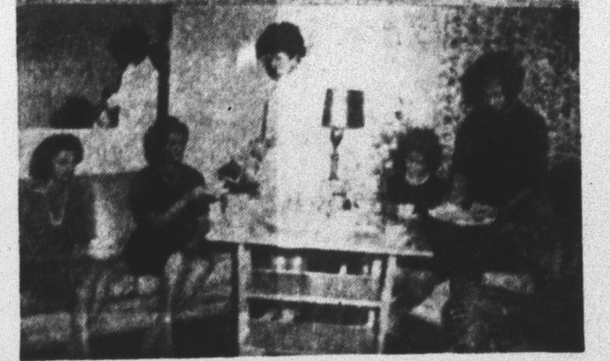
TOP: Histology and Microtechniques BOTTOM: Social Education at Fayetteville State

Through a well-planned program of liberal and professional education, Fayetteville State College develops its students toward a broad understanding of the basic principles and values in the social sciences, natural sciences, and the humanities. The ultimate aim of the institution is to equip each student to the upper limit of his potentialities for the roles of good citizenship and a position of respect and leadership in vocational pursuits. In order to achieve its ultimate aim, the college seeks to discover the potentialities of the student and helps him to become aware of them; it guides the student in the selection of curriculum experiences which will enhance his development in preparation for his abilities and offer basic and thorough instruction for creative thinking and resourcefulness. Fayetteville State College is constantly building the academic and social climate due to the fact that students learn