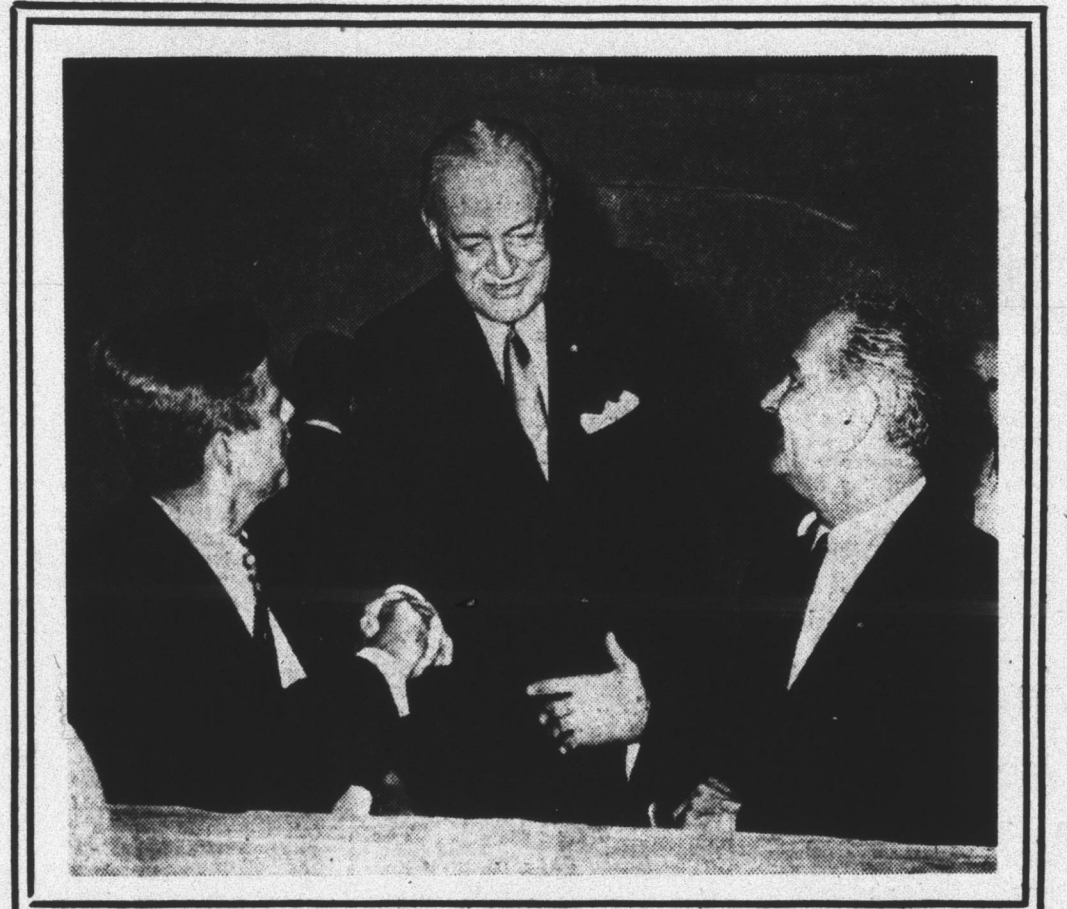
THE LATE PRESIDENT JOHN F. KENNEDY AND PRESIDENT JOHNSON CONGRATULATE CONGRESSMAN COOLEY ON A LEGISLATIVE VICTORY.