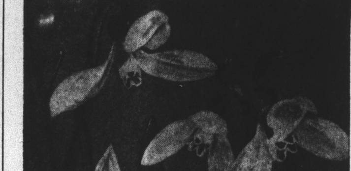
Snowdrops, one of the earliest of the bulbs that bloom in spring, should be planted in early autumn; set 2 inches deep.