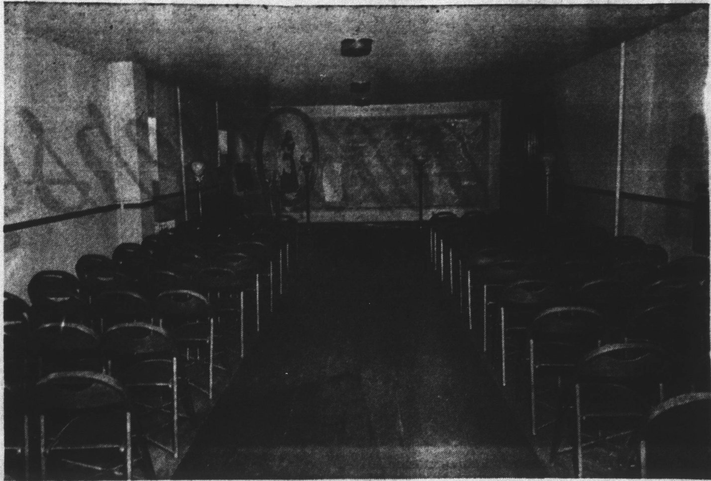
THE CHAPEL OF RALEIGH FUNERAL HOME WILL SEAT 200 PERSONS

"We think this is our greatest issue," the publishers added. Green Book is published at 730 E. 63rd St., Chicago, Ill., 60637.