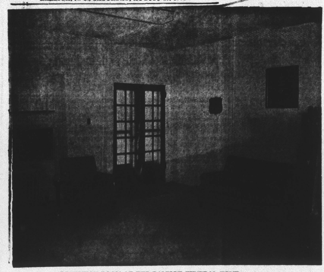
RECEPTION ROOM OF THE RALEIGH FUNERAL HOME