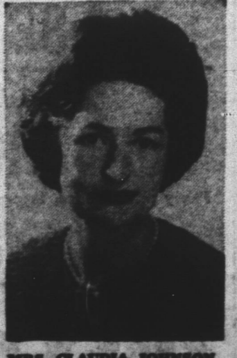
MRS. CLAUDIA JOHNSON

ARLINGTON, Va. — Mrs. Lyndon B. Johnson began her whistle stop tour of the southland Tuesday morning with a strong plea for equal rights for all Americans. "We are a nation of laws, and our greatness is our ability to adjust to national consensus." Mrs. Johnson, whose given name is Claudia, spoke from the rear platform of the gaily colored "Lady Bird Special" as she embarked on the four day tour which takes her through 1,662 mile route covering Virginia, the Carolinas, Georgia, Louisiana and Florida. Three bands from Virginia high schools struck up "Yellow Rose of Texas" as the train pulled in the sliding. They