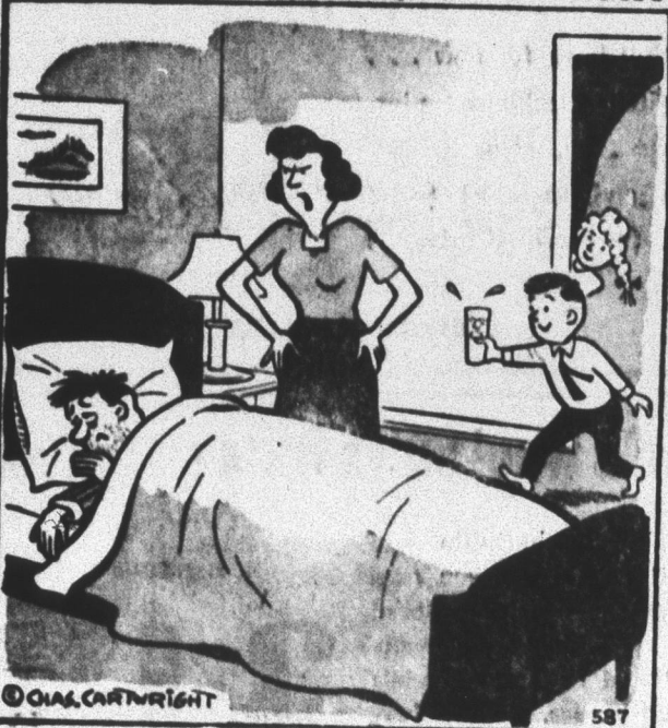
"I'm through nagging you to get up for church. From now on I'm using ice water!"