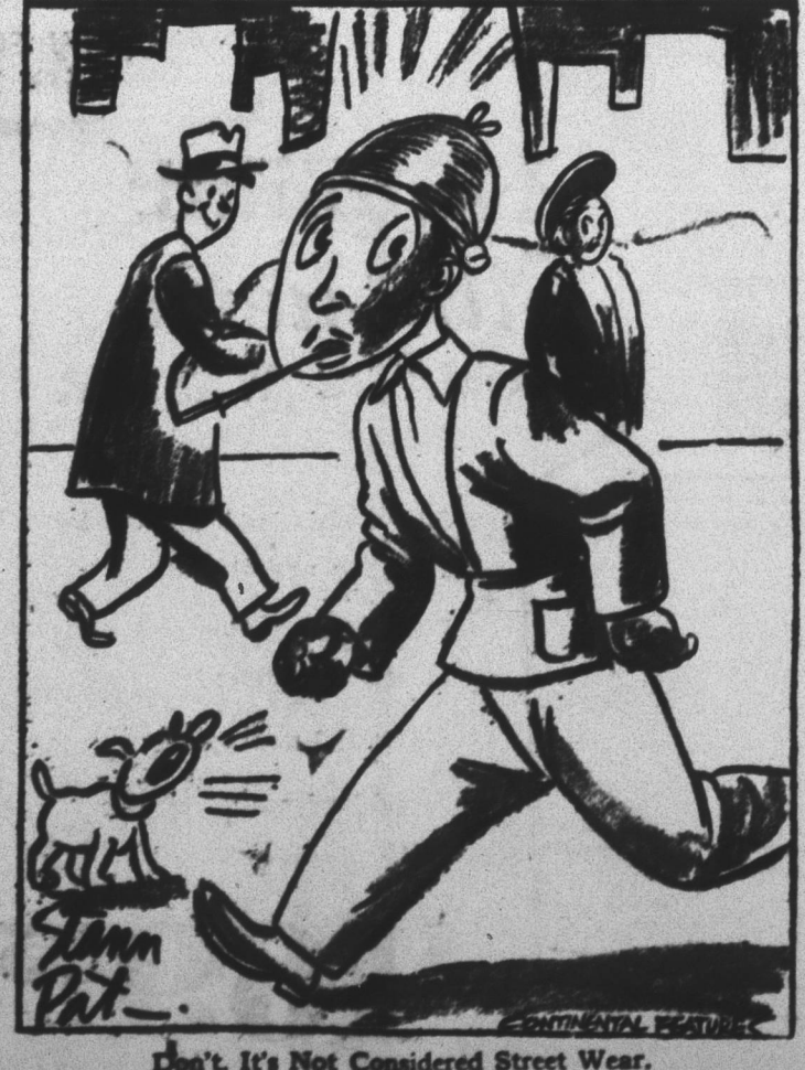
Don't. It's Not Considered Street Wear.