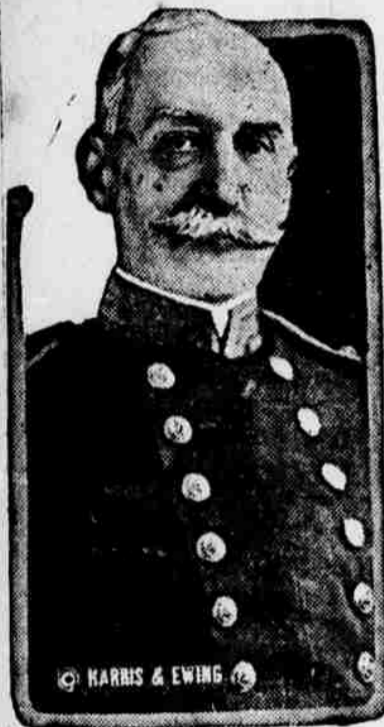
REAR ADMIRAL W. S. BENSON. Chief of naval operations and ranking officer of the United States navy since the death of Admiral Dewey.