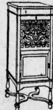
William & Mary