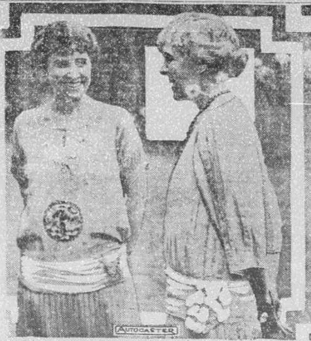
Mr. Calvin Coolidge and Mrs. Chas. Dawes, in an unconventional rejoice in the victory of their husbands.