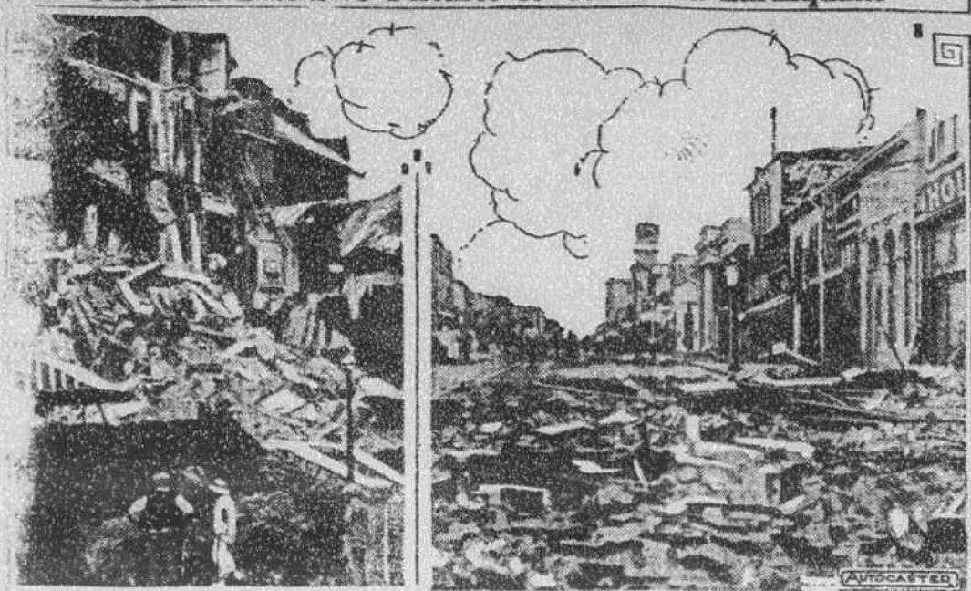
Here are two remarkable pictures, sent by telegraph, of the ruin in Santa Barbara, Calif., caused by the earthquake. At the left, the photo shows the ruins of the famous Arlington Hotel, almost completely wrecked. At the right—a view of State Street—principal business thoroughfare—as it looked one hour after the quake.