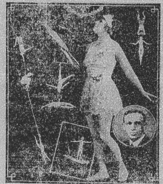
THE ETZ DUO

Big favorites everywhere in past seasons and duplicating these honors again this year are the original Roeders. This act is comprised of a man, a woman and a dog and is exceptionally clever acrobatic comedy act. They present some very clever and sensational tricks, interspersed with wonderful comedy. The dog, comprised of a man, a woman and a dog, and is an exceptionally trained, and does a number of wonderful tricks that strongly appeal especially to the women and children. The girl in the act is very pretty, making an admirable foil for the funny antics of the clown. The Roeders are presented here under the highest recommendations from other cities they have visited.