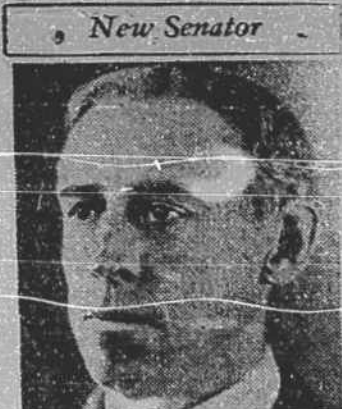
William E. Brock, the newly appointed U.S. Senator from Tennessee.

Chicago, Sept. 21—Formal announcement of her candidacy for the Republican nomination for the United States senate has been made by Ruth Hanna McCormick. Thus will begin what promises to be one of the most fascinating political fights since women became eligible for public office. At the knee of her father, the famous Mark Hanna, of Ohio, and later through association with her husband, the late Senator Medill McCormick, Ruth Hanna learned the fundamentals of practical politics early in life. She was a young girl in 1895 when her father conducted the "front porch" campaign at Canton, Ohio, which put