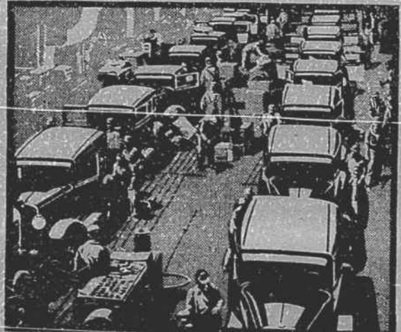
Modern production methods assure high quality