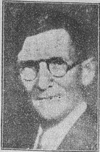
Hon. A. J. Maxwell, Commissioner of Revenue, who spoke at the College Auditorium on Monday evening in support of the proposed new Constitution for the State of North Carolina.