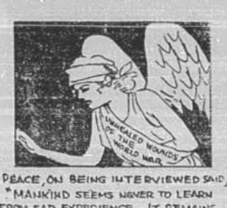
FROM SAD EXPERIENCE . IT REMAINS FOR ME CONTINUE MY WEARY STRUGGLE UNWARD THROUGH THE DARKNESS