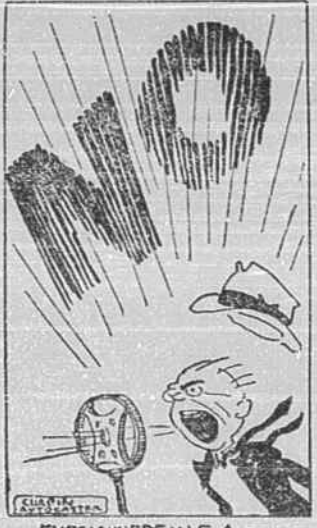
EVERYWHERE; U.S.A. — MR. JOHN Q. PUBLIC, ASKED WHETHER HE FAVORED THE U.S. MEDDLING IN THE EUROPEAN MESS SAID -