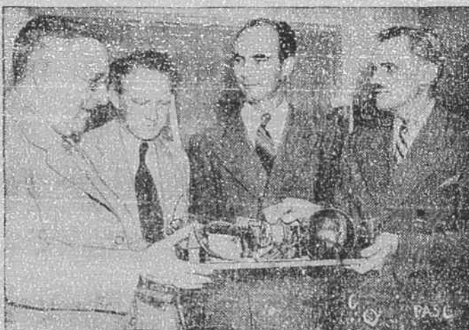
CHICAGO, Ill. . . . Four Nobel prize winners headed an array of physicists who gathered at the University of Chicago to take part in the international symposium on cosmic rays. Left to right: Dr. Victor F. Hess of Fordham University, professor of physics; Dr. Werner Karl Heisenberg, professor of theoretical physics at the University of Leipzig; Dr. Carl D. Anderson, California Institute of Technology; and Dr. Arthur H. Compton, University of Chicago physicist.