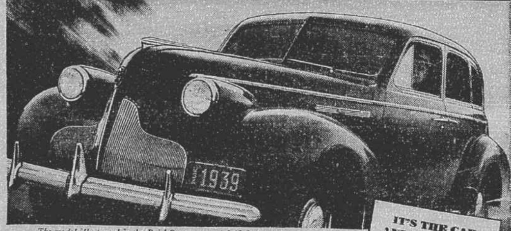
The model illustrated is the Buick Special, model 41 four-door touring sedan $996 delivered at Flint, Mich.*

WHAT —no breezes? Then what you need is a Buick—it makes them to order! A hundred and then some Dynafash horsepower—an outlook that's wide as all outdoors—the freshest, smartest styling found on any road today—the level-flying comfort of the "full float" BuCoil ride—all yours for less than you're asked for some sixes! For a cooler, pleasanter summer—see the nearest Buick dealer about delivery dates on this hot-footing honey.