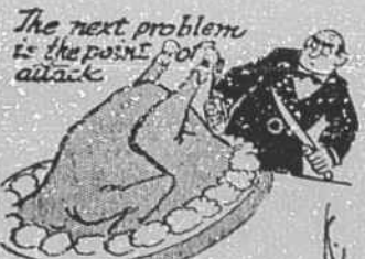
The next problem is the point of attack.

Only a few simple rules need be followed. The most important, of course, is to keep the bird on the platter, because it's rather difficult to work on the floor. Also, the bu-