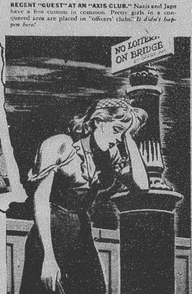
RECENT "GUEST" AT AN "AXIS CLUB." Nazis and Japs have a fine custom in common. Pretty girls in a conquered area are placed in "officers' clubs." It didn't happen here!