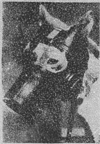
Styles change for the K-9 forces in Europe as rapidly as the fashion in ladies' hats. The newest is shown on one of the prize war dogs, some place in Europe. This mask gives protection but does not interfere with the work of the K-9 corps.