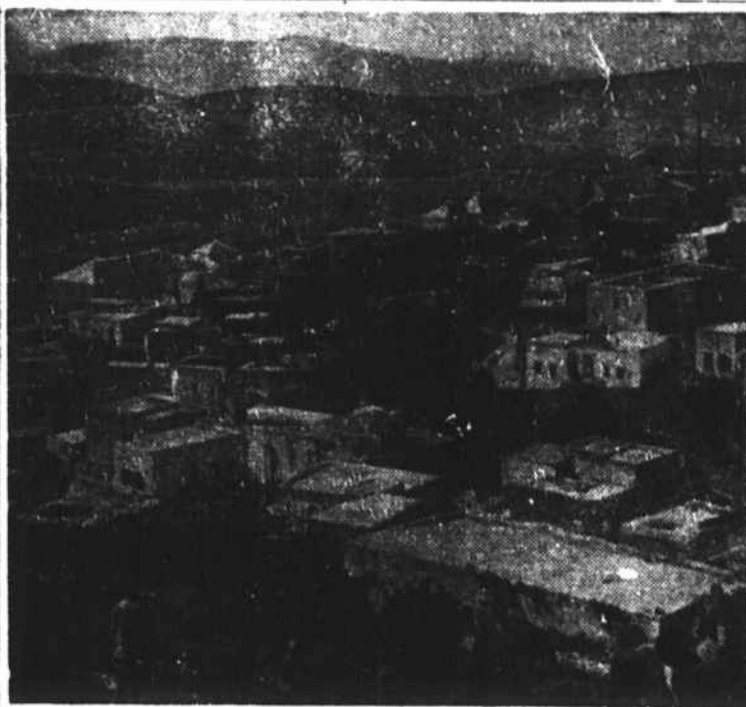
WHERE THE BOY JESUS PLAYED . . . Looking southeast from the Hill of Precipitation, Nazareth, is shown the view where the boy Jesus played.

SYNCHRONIZE YOUR WATCHES ... It's zero hour as children everywhere get their Christmas scout cars and tanks for an all-out assault. It is the first time for several years that rubber tires have been included with toys of these types.