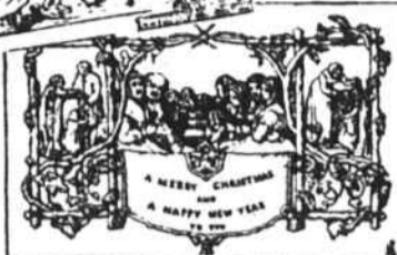
Claims to being "firsts" among Christmas cards are held by these early designs.

"Which came first?" and "who thought of it first?" are the two questions asked since time immemorial. These questions have baffled historians, challenged detectives, caused law students to turn the midnight oil—but most of all—have intrigued the public. For the last few years there's been a big to-do about the "first" Christmas card and the subject has fascinated many greeting card collectors, art dealers, museum curators and a sizable portion of the American and British public.