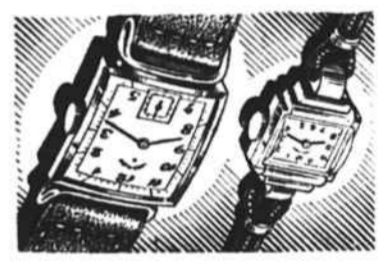
ELGIN WATCHES $33.75 up