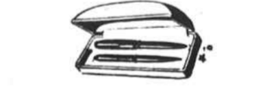
FOUNTAIN PENS Parker — Waterman Sheaffer — Eversharp