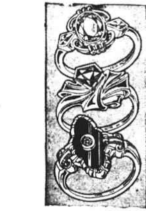
RINGS Birth Stones Dinner Rings