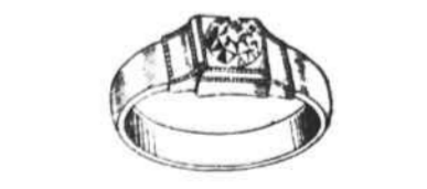
GENTS' RINGS $12.50 to $100.00