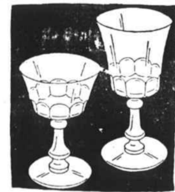
CRYSTAL Fostora — Tiffin Cambridge