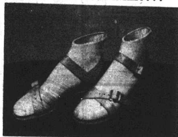
MADE TO ORDER