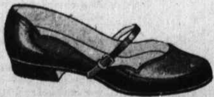
SOLID BLACK and BEUE $2.95