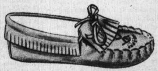
SOFT SOLE—Red, Green, Black, White, Light Tan — $2.95

We have and are receiving almost daily NEW STYLES IN SHOES for every member of the family. Pictured are just a few of the many styles and leather combinations we are showing this Spring. We are showing the most diversified line of shoes we have ever shown. We carry Weyenberg Shoes for Men, Natural Bridge Shoes for Men and Women, Red Riding Hood Shoes for Children, Freidman Shelby Work Shoes for Men.—Easter is on its way—Make BELK'S Your Headquarters for All Your Shoe Needs.