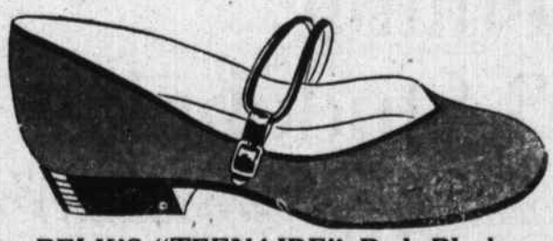
BELK'S "TEENAIRE"—Red, Black, Patent, and White — $3.95

We have and are receiving almost daily NEW STYLES IN SHOES for every member of the family. Pictured are just a few of the many styles and leather combinations we are showing this Spring. We are showing the most diversified line of shoes we have ever shown. We carry Weyenberg Shoes for Men, Natural Bridge Shoes for Men and Women, Red Riding Hood Shoes for Children, Freidman Shelby Work Shoes for Men.—Easter is on its way—Make BELK'S Your Headquarters for All Your Shoe Needs.