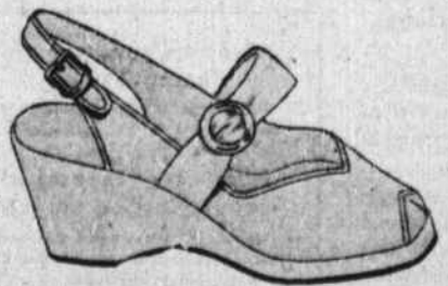
SOLID WHITE, Narrow and Medium Width — $3.95