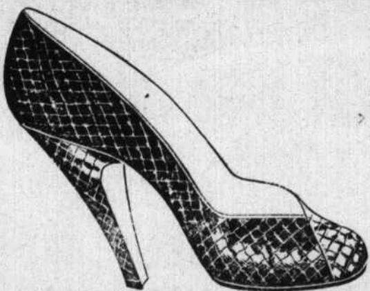
GENUINE COBRA—Green, Brown, Red, Also Tu-Tones — $6.95