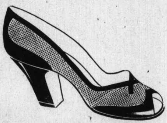
WHITE MESH Trimmed in Black Patent $5.95