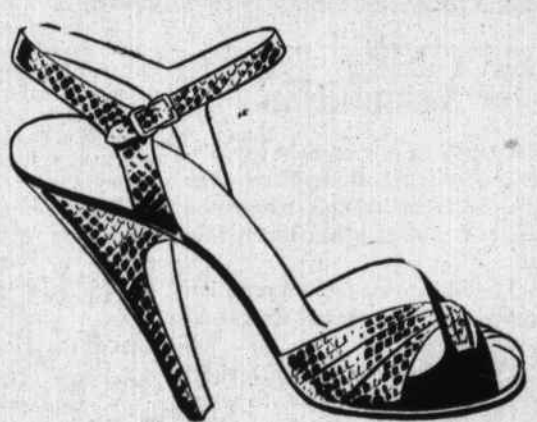
GREY COBRA $6.95