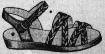
SOLID WHITE and SUN TAN $2.95

SHOP AT BELK'S TODAY AND EVERYDAY AND SAVE!