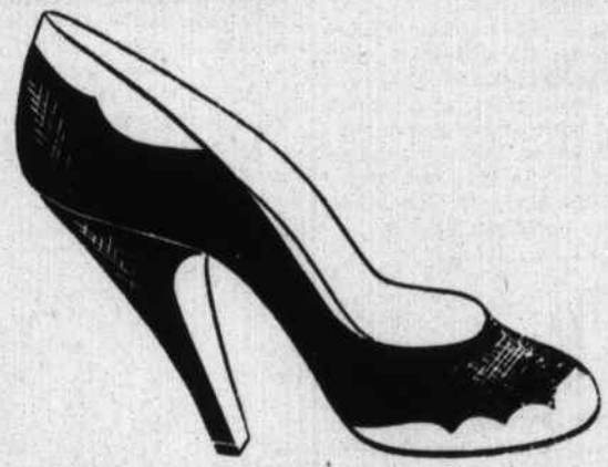
BLUE LINEN—White Leather Trim $5.95