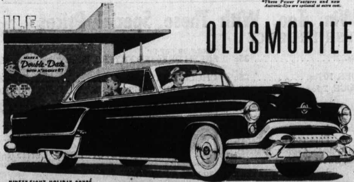
NINETY-EIGHT HOLIDAY COUPÉ