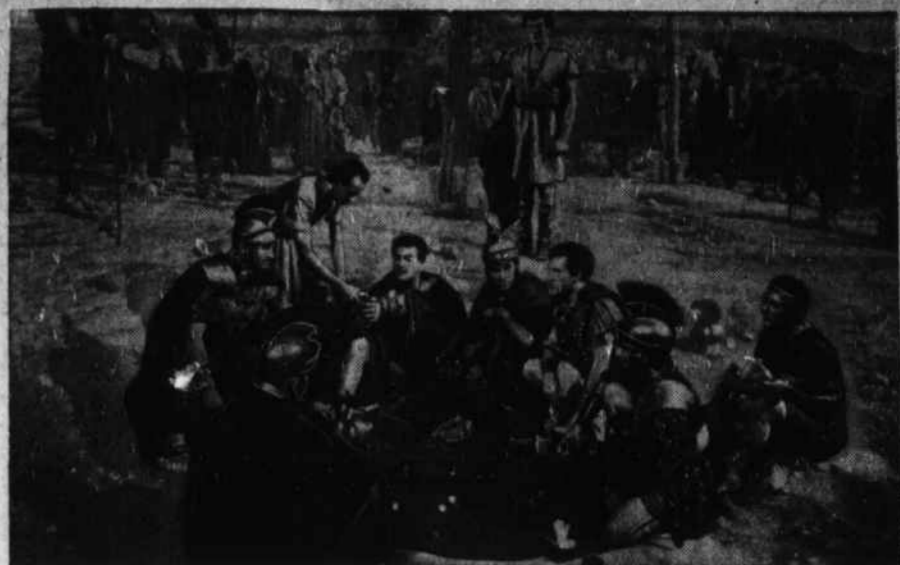
One of the unforgettable sequences in "The Robe," the first production in the revolutionary new process of CinemaScope, starting May 1, for 3 big days at the Appalachian Theatre, in Boone.

Mrs. Roosevelt says Senate must curb McCarthy.