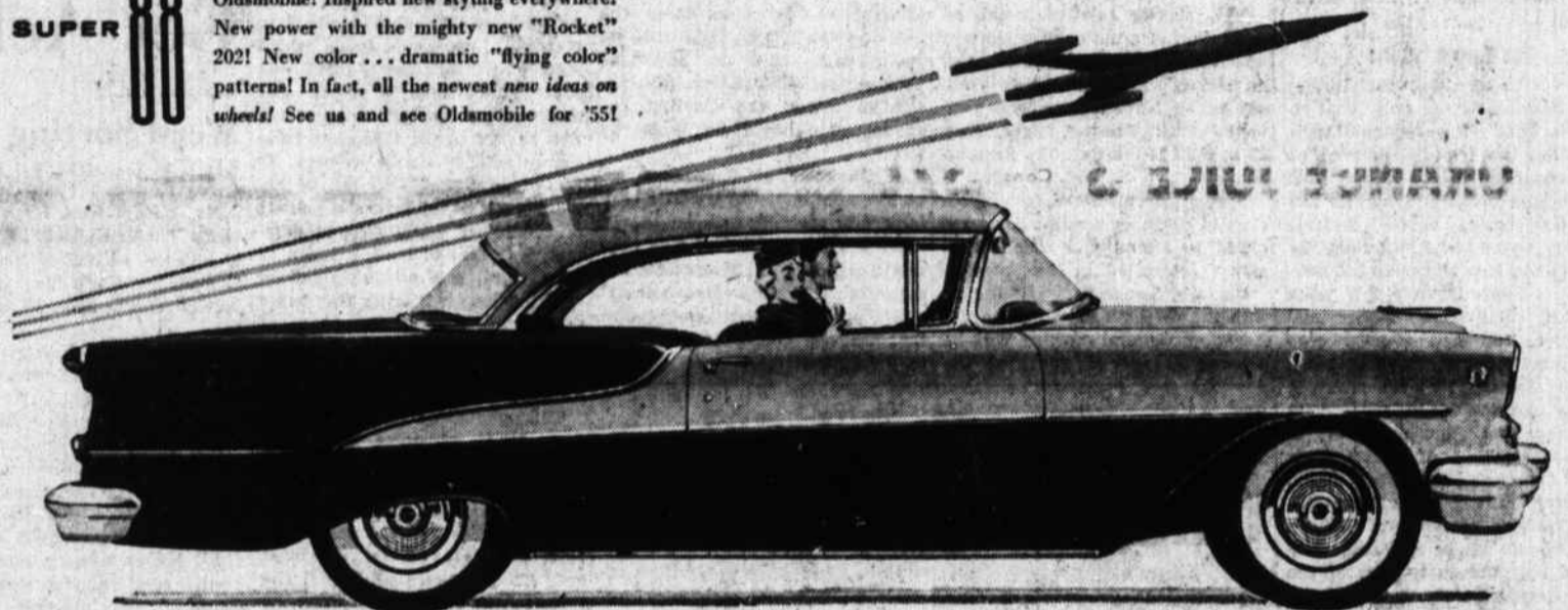
New 1955 Oldsmobile Super "88" Holiday Coupé. A General Motors Value.

Never so new as now . . . never so far ahead! It's the dazzling, all-around-new Super "88" Oldsmobile! Inspired new styling everywhere! New power with the mighty new "Rocket" 202! New color . . . dramatic "flying color" patterns! In fact, all the newest new ideas on wheels! See us and see Oldsmobile for '55!